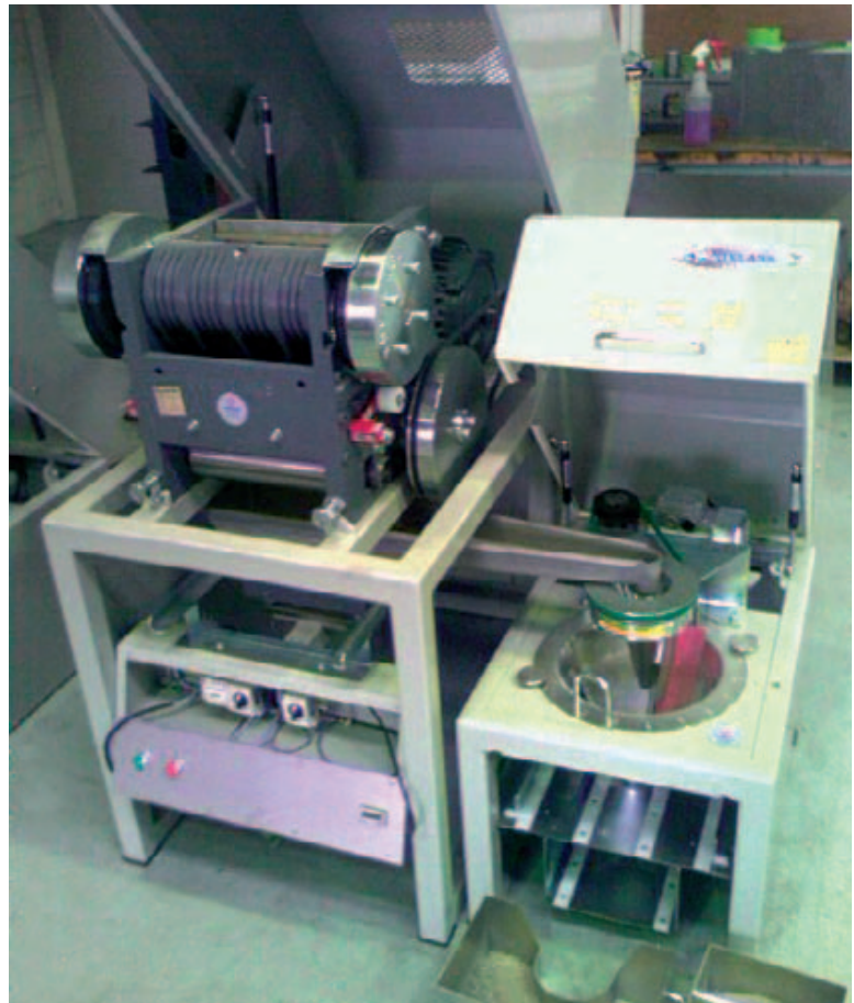
Specialised wear parts made by A&G Price are used in Rocklab's advanced laboratory crushers

The fully-integrated engineering works has a proven track record of minimising expensive down-time for clients by completing complex refurbishments cost-effectively and tight time frames. In an industry where component failure could result in injury or environmental hazard, A&G Price's emphasis on quality control results in a build quality that can be relied on.